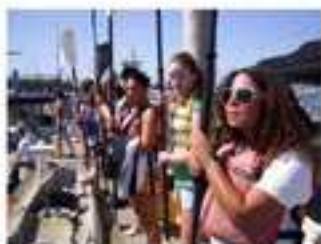
teens kayaking summer, 2009

The program is being strongly subsidized by the Jewish Federation of Ventura County , who wish to support our teens as they grow, learn and have fun together.