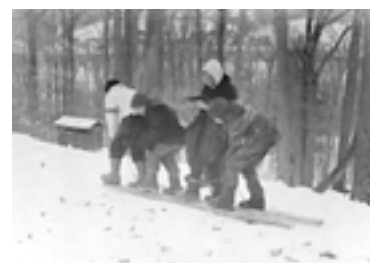
A patrol attempts the snowshoe event during afternoon competition

More than 20 patrols competed in Tuscazoar's sixth annual Gold Rush Competition in February. Top finishers in the Senior Division were: Troop 88 Fox patrol, first place; Troop 575 Sepultra Patrol, second place; and Troop 94 Scorpions, third place. In the Junior Division, the Knights of Troop 575 finished first, the Nighthawk patrol from Troop 935 finished second, and the Beaver patrol of Troop 150 finished third. In the Cub Division, Troop 244's Cobra patrol finished first.