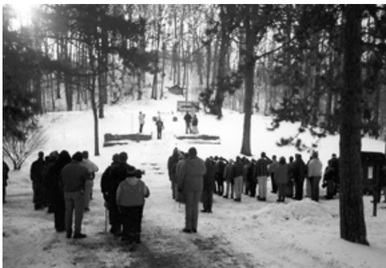
Units gather in central camp for the traditional flag-raising ceremony prior to the 1994 Gold Rush Competition.

Camp Tuscazoar "Breeze" is published by the Camp Tuscazoar Foundation, Inc. P.O. Box 308 Zoarville, OH 44656-0308