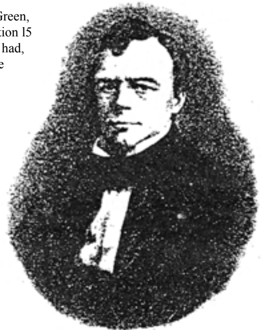
David Tod, Governor of Ohio from January, 1862 to January, 1864, briefly owned a portion of the present-day Camp Tuscazoar property.