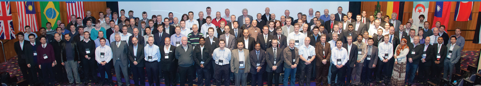
Conference Delegates, Hobart 2012