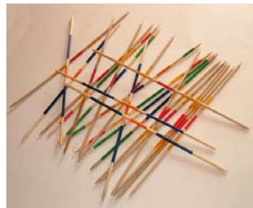
Pick up sticks