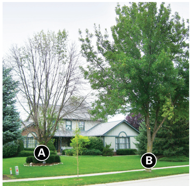
Untreated Ash Tree (A) Compared to an Ash Tree Treated with Arborjet (B)

ARBORJET Revolutionary Plant Health Solutions