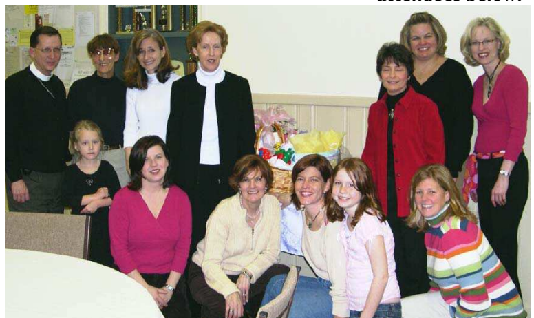
Nursery Shower attendees below:

We are blessed to have such faithful and caring parishioners volunteering their time to care for our little ones!