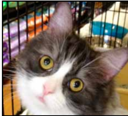
Lola (above) and Venus (below) at an adoption event

Lola and Venus (Persians), Samson (Maine Coon mix) and Emmett were all adopted out to new loving families.