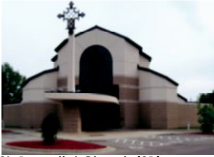
St. Benedict Church (SB)

United in Faith, Hope and Service to the Community