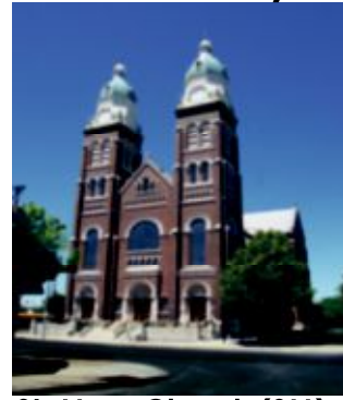
St. Mary Church (SM)

Sick call Emergency Number: 228-6123 x29/26