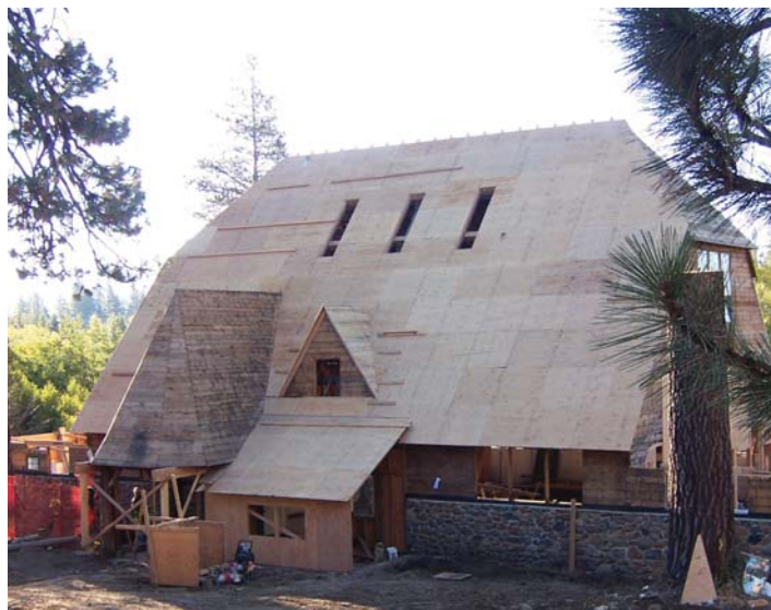
The UC Davis Tahoe City Field Lab ("Historic Fish Hatchery") is currently being renovated at 2400 Lake Forest Road in Tahoe City, California.

The entire report is free and available online at http://terc.ucdavis.edu .