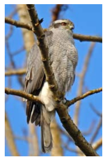
Northern Goshawk

Maplewood Hill Park in Edmonds. This small park is in a canyon on the outskirts of town. If you go, I recommend staying