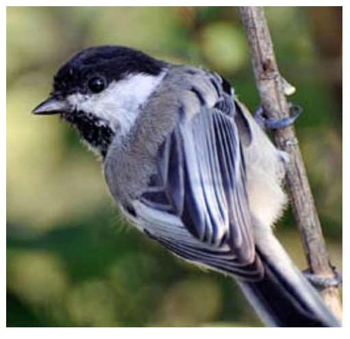
Black-capped Chickadee, by Shanna Martin

Ring-necked Pheasant, 2 Red-tailed Hawks, 2 Blackheaded Grosbeaks, 3 owl species at the end of Juniper,