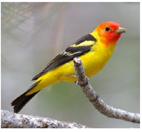
Western Tanager, by Donald Metzner