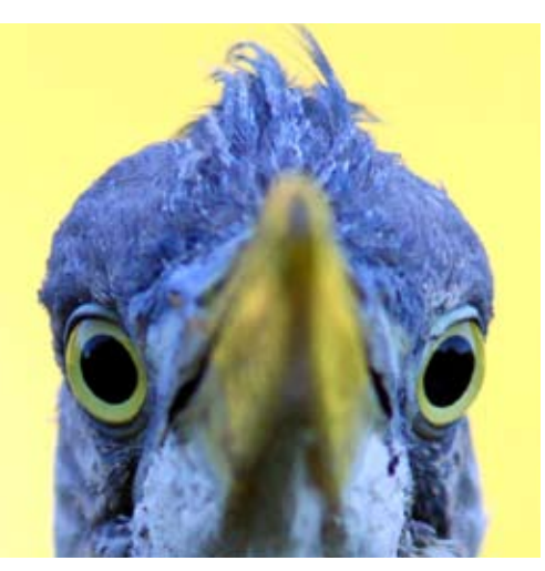
Great Blue Heron, by Nigel

Comments and suggestions are always welcome. Please e-mail me at pricemara@clearwire.net or leave a message at 425.750.8125.