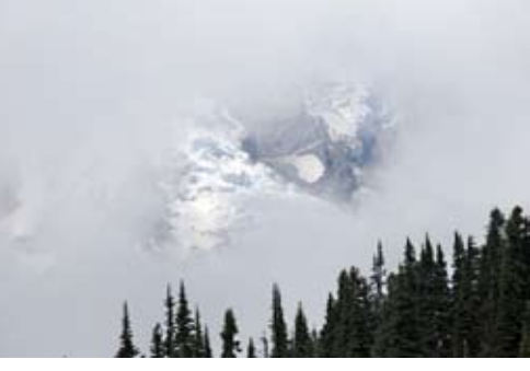
Weekend hikers were treated to gorgeous peek-a-boo views of Mt. Rainier.

The parking lots were nearly full. But, people and cars weren't all we found in the parking lot. Amongst the "Do not feed the birds" signs was a tame Clark's Nutcracker – a lifer for a few in our group. We also heard juncos from the parking lot.