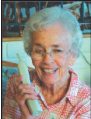
Daily Well Being Checks