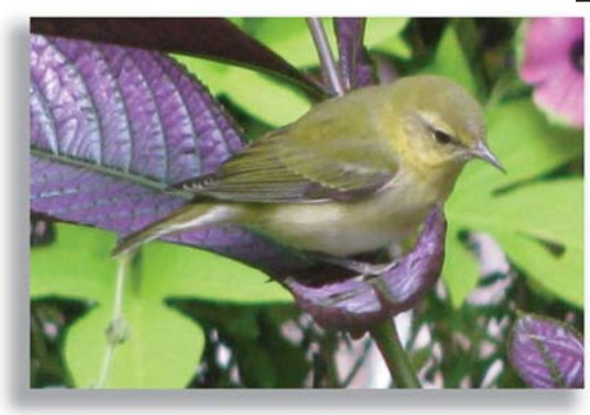
Tennessee Warbler