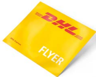
Flyer large Protection for the main packaging Dimensions: 47.5 x 38 cm Free packaging