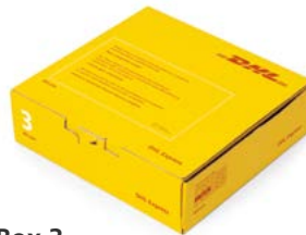
Box 3 Dimensions: 33.7 x 32.2 x 10 cm Suggested weight up to 2 kg Free packaging