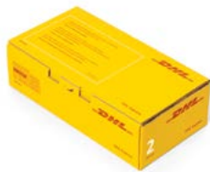
Box 2 Dimensions: 33.7 x 18.2 x 10 cm Suggested weight up to 1 kg Free packaging