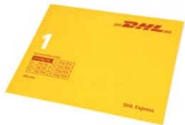
Card envelope Dimensions: 35 x 27.5 cm Suggested weight up to 0.5 kg Free packaging