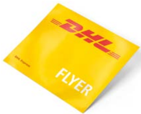
Flyer standard Protection for the main packaging Dimensions: 40 x 30 cm Free packaging