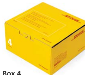
Box 4 Dimensions: 33.7 x 32.2 x 18 cm Suggested weight up to 5 kg Free packaging