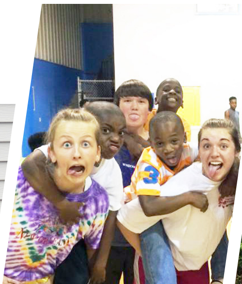
Mission Trip Sponsorship Sponsor Easter's Youth Missionaries