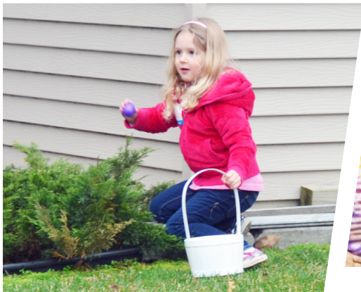
Easter Celebration & Egg Hunt Saturday, March 28 at Easter by the Lake