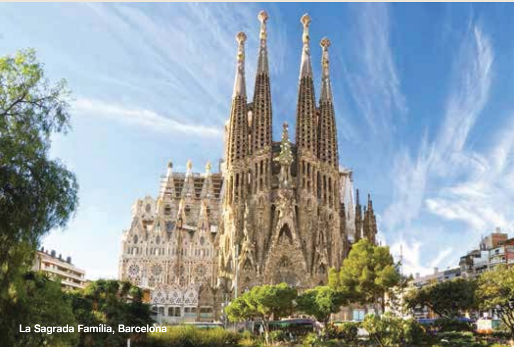
La Sagrada Família, Barcelona

All stateroom/suite locations and prices are subject to availability. Deposit and cancellation policies for categories OS, VS, and OC differ from those listed in this brochure. Please call for details.