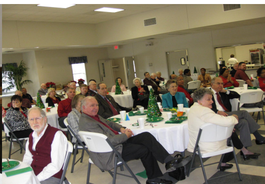
Over 100 in attendance....

"When God speaks to you, ACT NOW! Don't put it off until later!"