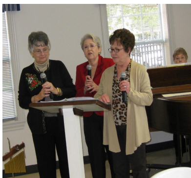
And a Trio sang carols

Many, many thanks to First United Methodist of Madisonville for your hospitality, preparation, fellowship, food, festive atmosphere and spectacular entertainment!