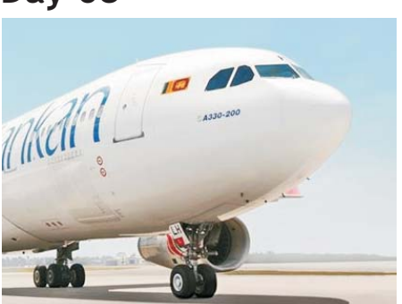
After Breakfast leave for Airport