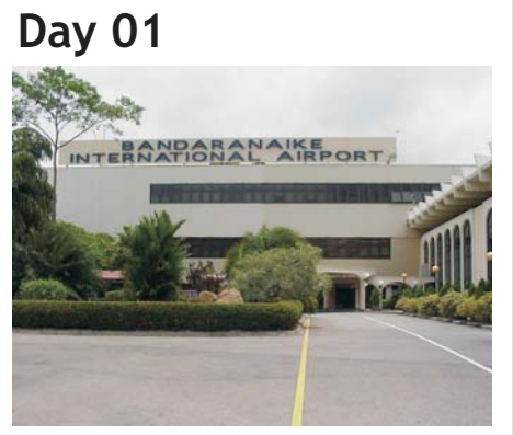
Arrival from Katunayake International Airport and transfer to Colombo. Check-in to the hotel. Rest of the day at leisure. Overnight stay in Colombo