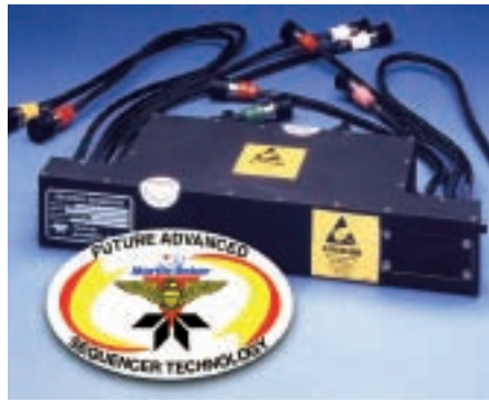
NACES/FAST sequencer. The "FAST" is a major upgrade to the original NACES version although the housing remains essentially the same.

Low (Altitude) Drogue Mode with Continuous Sensing, in which a seat stabilizing/retarding drogue phase occurs, which is required when the ejection occurs at either a significant airspeed or significant air pressure altitude. The sensed acceleration, pitot pressure, and base pressure values are used to give a prediction of the parachute deployment time when the velocity of the seat has decayed such that peak parachute inflation loads will fall within required limits. The aim is to