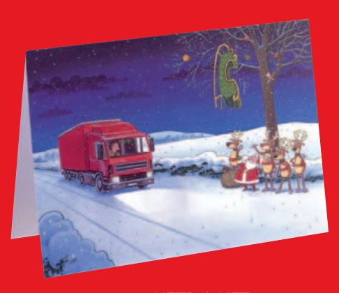
X350 – NEED A LIFT