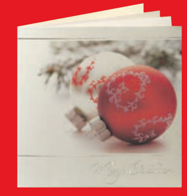
X407 – RED & WHITE BAUBLES