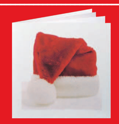
X221 - SANTA'S HAT