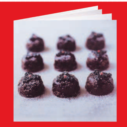
X305 – PUDDINGS