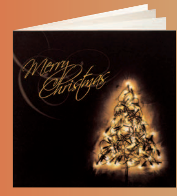
X315 – CHRISTMAS TREE LIGHTS