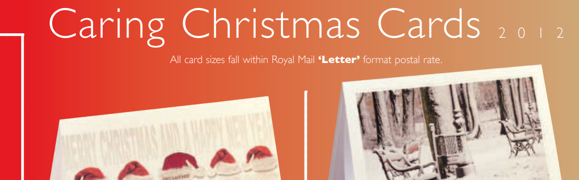
X405 – SANTA'S HATS