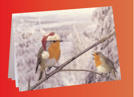
X414 – FESTIVE ROBIN