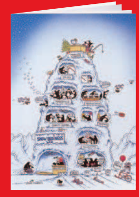
X340 - SNOW BUSINESS