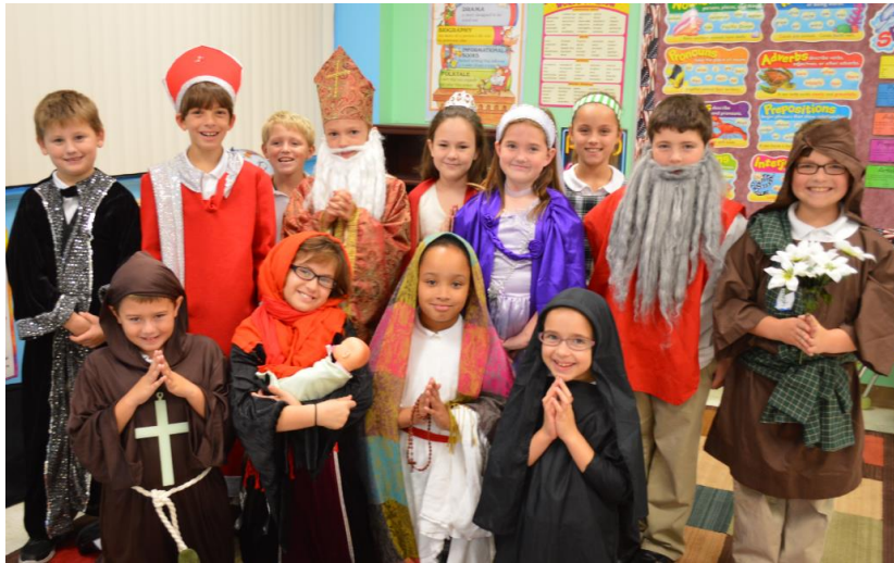
3 rd Grade

Our school celebrated All Saints Day last Friday, October 30 th at the 8am Mass. Students in PreK-4 through 3 rd grade dressed as Saints and processed from the school to the Church in our annual Parade of Saints.