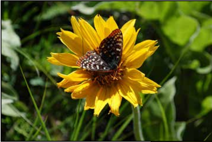
Carey's balsamroot ( Balsamorhiza careyana ) with Taylor's checkerspot butterfly