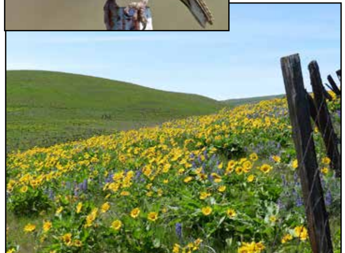
Balsam and lupine on the south side of Stacker Butte.