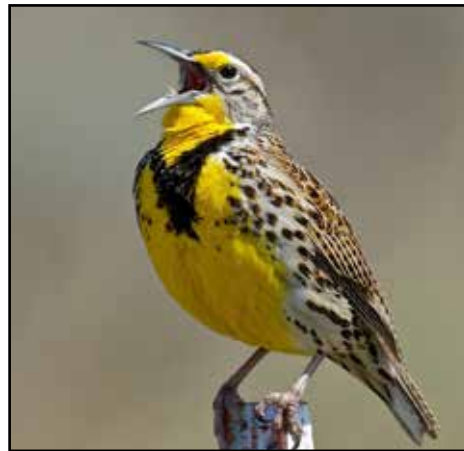
Sounds of spring: http://youtu.be/3o0FC7aqq94

When Myrin retired in 1998 as pastor of St. Luke Lutheran Church in Portland, we purchased the bare property on Oda Knight Road with the "retirement" wish of building a retreat facility. Awakening in the morning in our sleeping bags, and enjoying the early morning music of coyotes, roosters and birds, Myrin named it "Morning Song Acres." We eventually built a large, open house with sleeping quarters for a small crowd and a meeting room in the lower level. It sits uphill and to the west of the High Prairie Community Center, although that was built later.