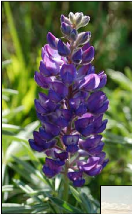
Broadleaf lupine ( Lupinus latifolius )

Visit the website version for more of Peg's wildflower photos: http://www.highprairie.us/high-prairie/vol-15-no-1/