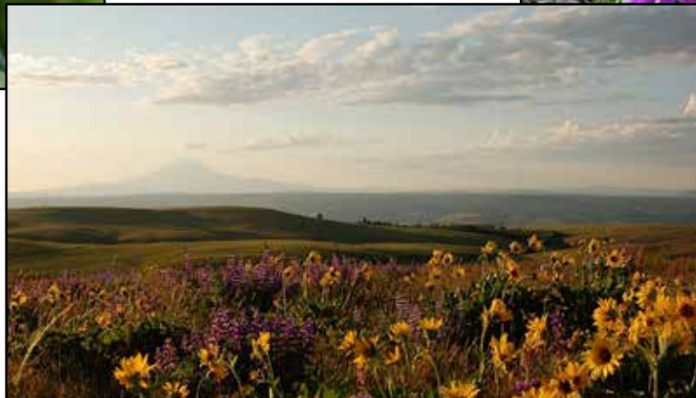
Spring evening view of Mount Adams with balsamroot and lupines