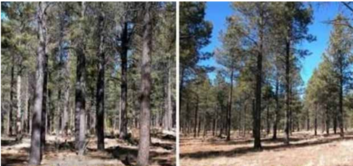
Removing the smaller, weaker trees from this forest (left) produced a more natural and healthier stand (right) that will be more resilient to wildfire and insect infestations.

THIS WILL ONLY HAPPEN WITH BOTH INDIVIDUAL AND COMMUNITY SUPPORT!