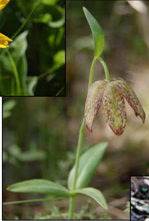
Chocolate lily ( Fritillaria affinis )