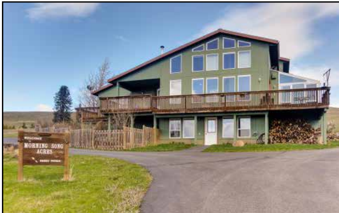
Top: (Counting Eagles) Castle