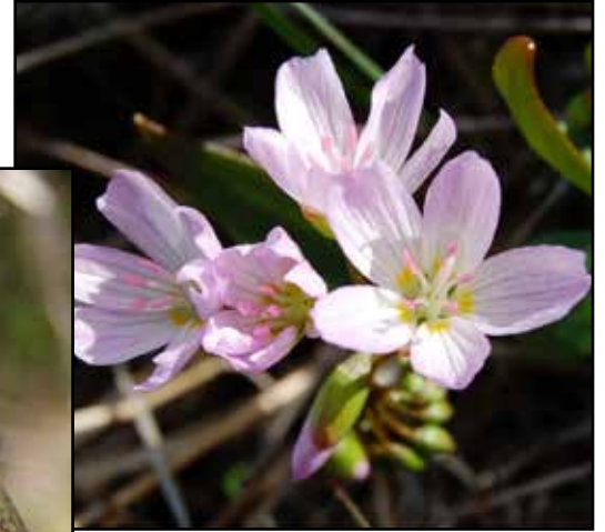
Oak's toothwort ( Cardamine nuttallii )