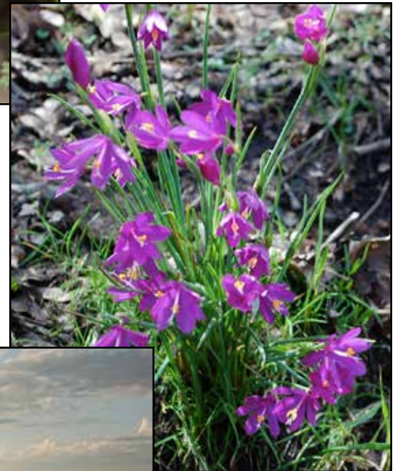
Grass widows ( Olsynium douglasii )

Visit the website version for more of Peg's wildflower photos: http://www.highprairie.us/high-prairie/vol-15-no-1/