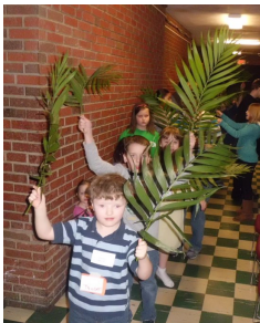
Malvern Campus Children on Palm Sunday

SAVE THE DATE—VBS: June 17-21 Ages 4 thru completed 8th grade!