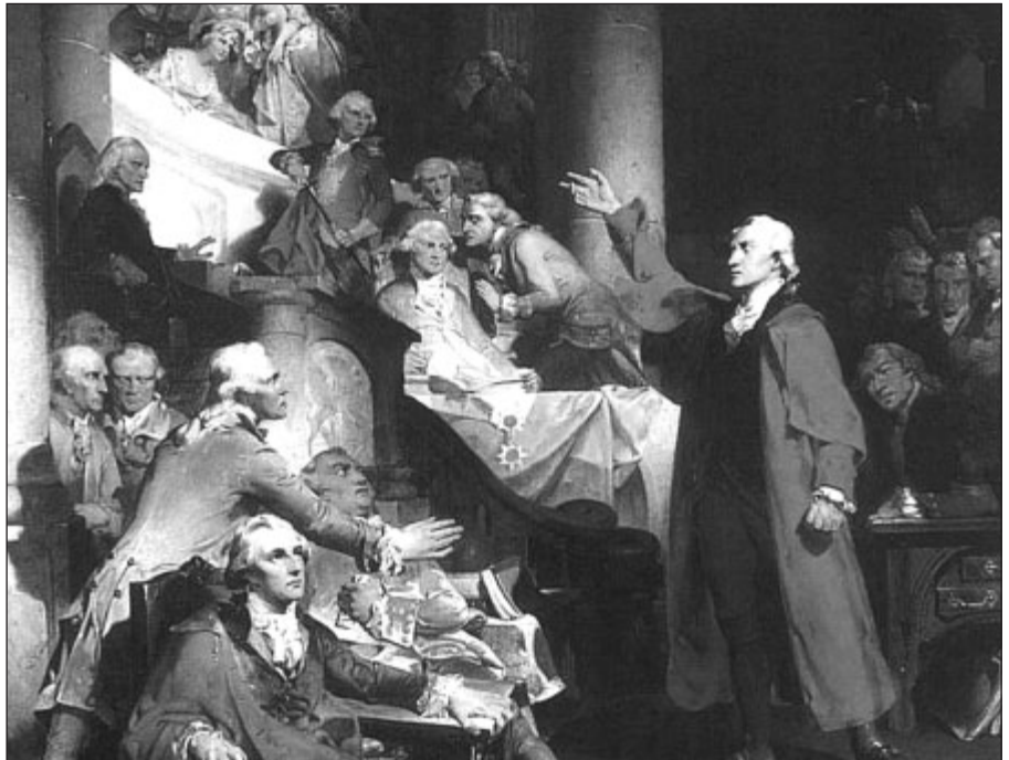
"PATRICK HENRY Before the Virginia House of Burgesses" (1851) by Peter F. Rothermel shows Patrick Henry making a speech against the Stamp Act of 1765, when he famously declared, "If this be treason, make the most of it!"

Four colonies adopted constitutions even before the Declaration of Independence was proclaimed on July 4, 1776. After that date, all the colonies