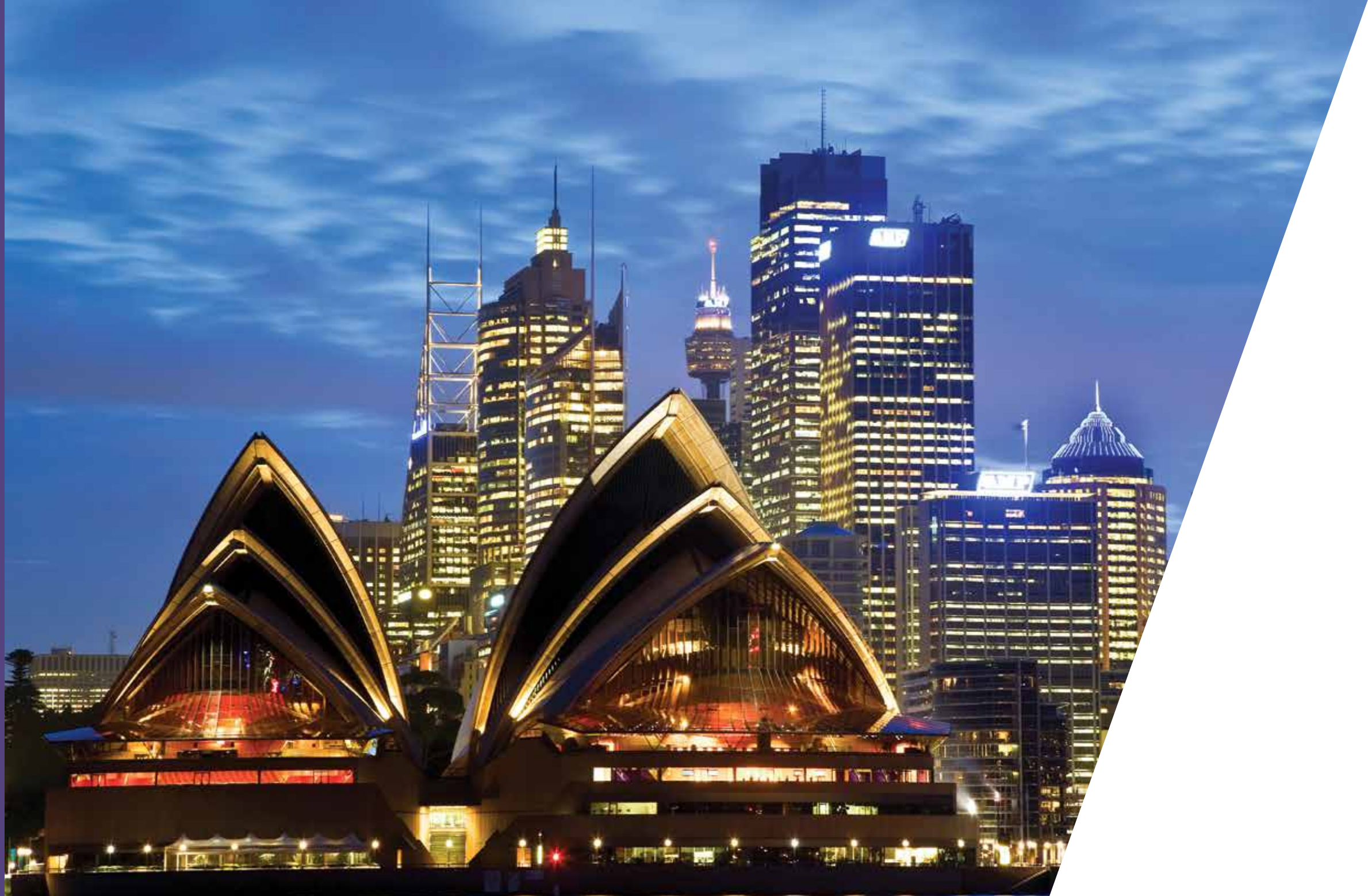
Sydney Opera House // Australia