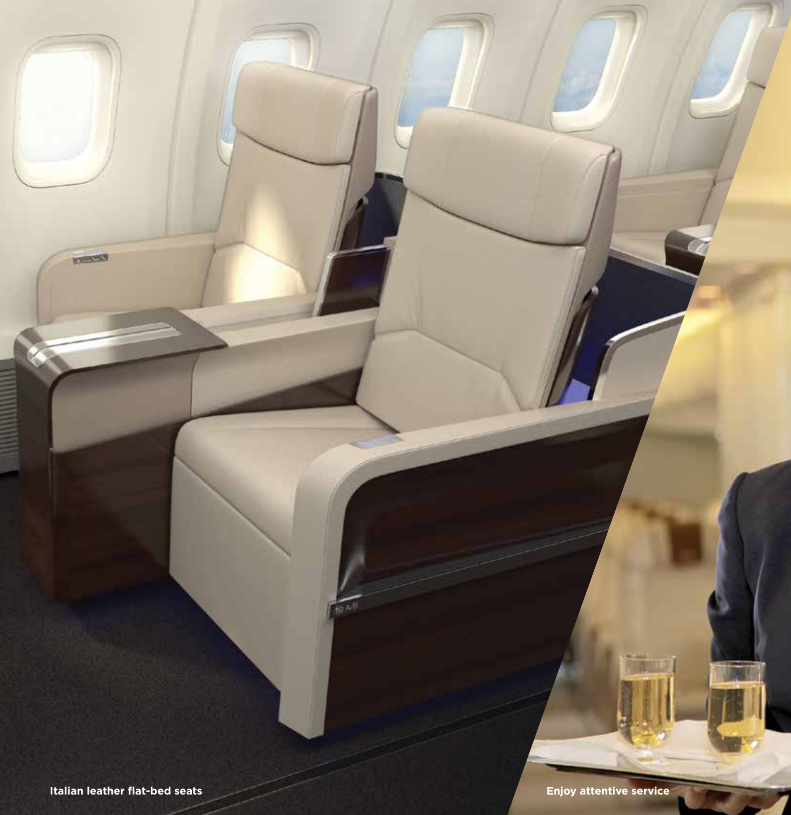
Italian leather flat-bed seats