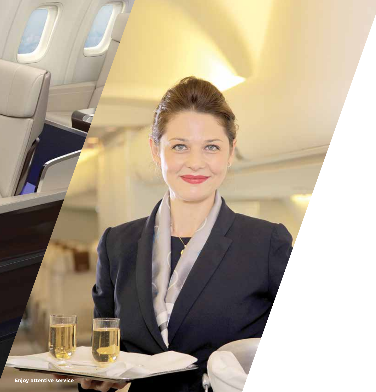
Enjoy attentive service