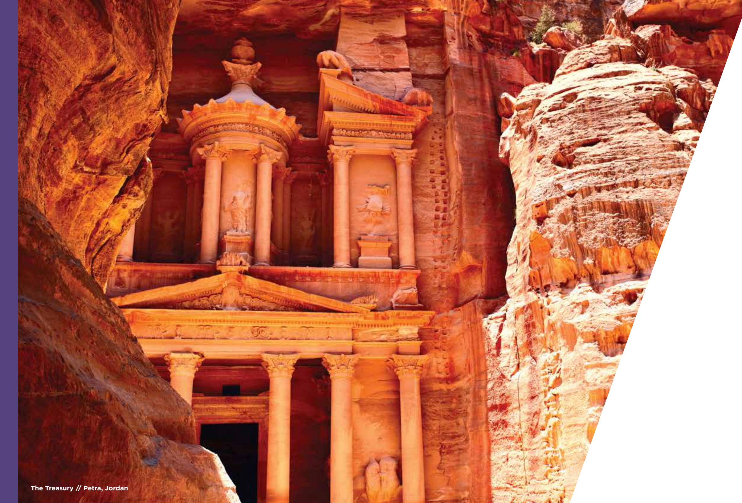
The Treasury // Petra, Jordan