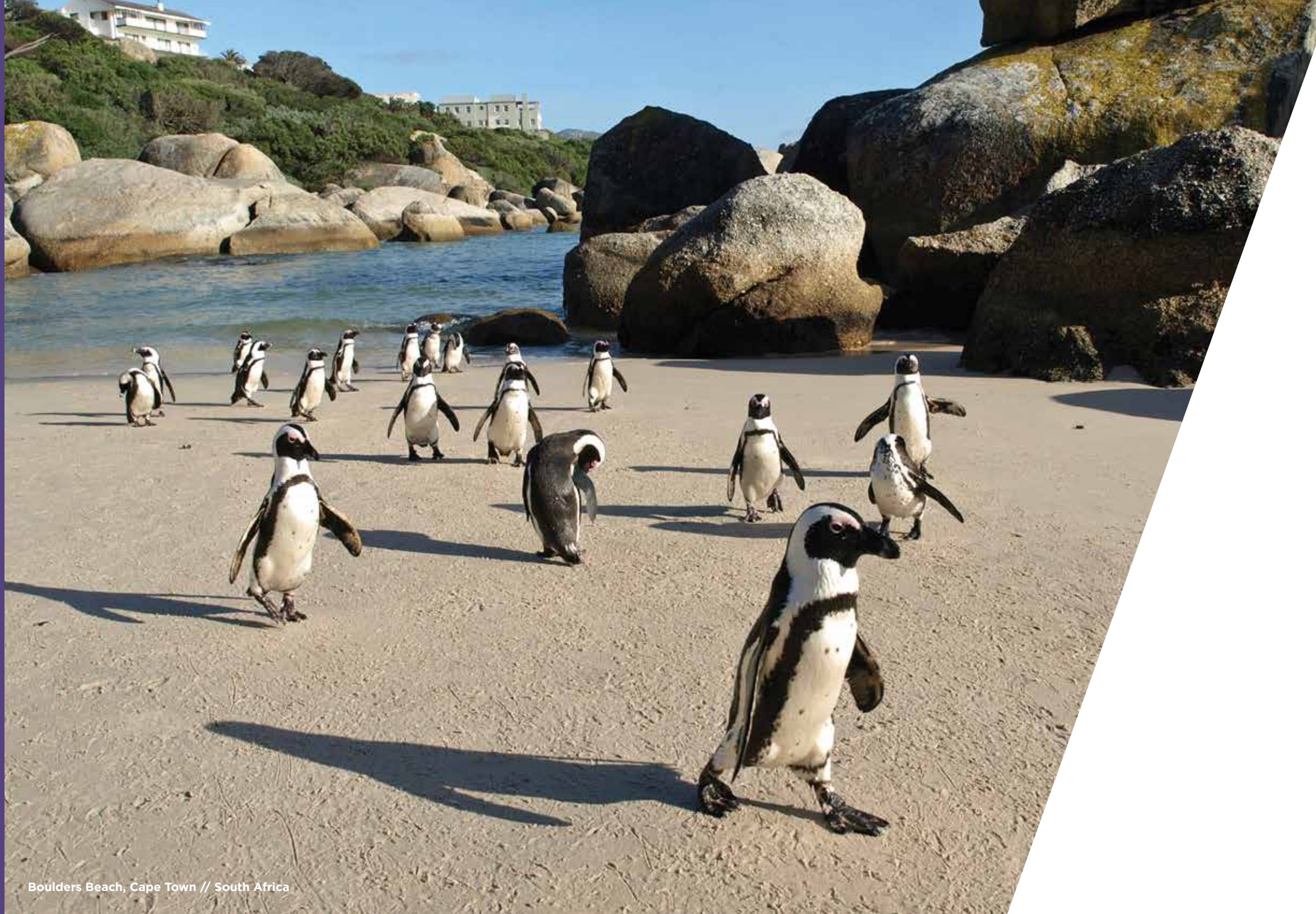
Boulders Beach, Cape Town // South Africa