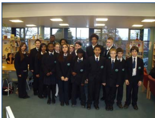
The Lea Valley High School Student Councils 2010/11: