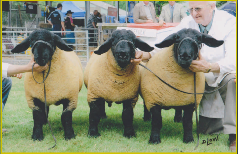
Winning Group Royal Show & Royal Highland Show 2009