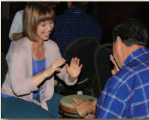
Share a Drum