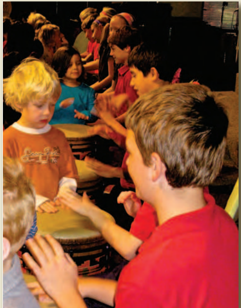
WMDrumming Class in Kansas