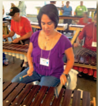
Hot Marimba Class