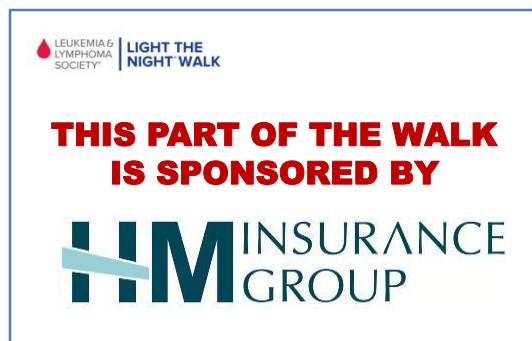
Example of 2' x 3' Walk route sign ($500 signs have same format).