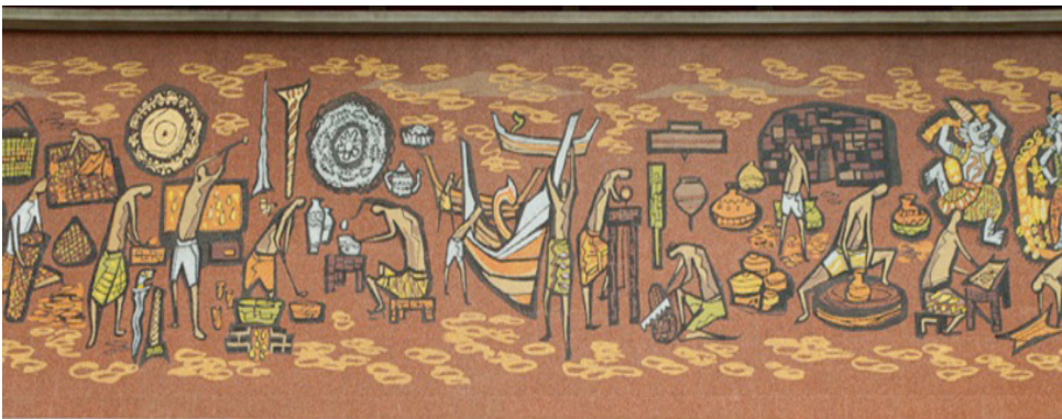
Photo 8 Cheong, Laitong, Mural ; detail (1962). Glass mosaic. 115 × 20 ft. National Museum Malaysia, Kuala Lumpur.

This tells us that he was critically sensitive in producing an image that avoided essentialist characteristics (see Photo 8).