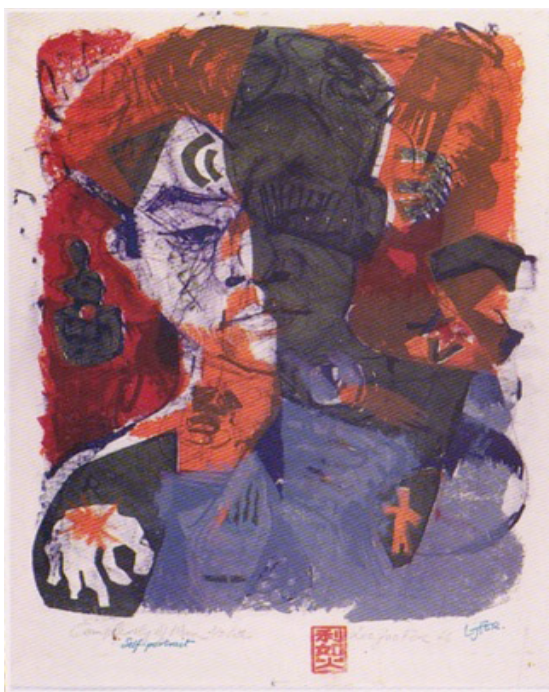
Photo 1 Lee Joo For, Complexity of Man, Self-Portrait (1966). Lithography AP. 17 × 25 in.