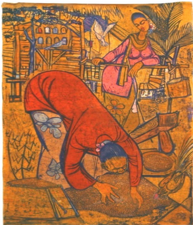
Photo 6 Chuah, Thean Teng, Busy (ca.1962). Batik. 91 × 68 cm. National Visual Art Gallery, Kuala Lumpur.