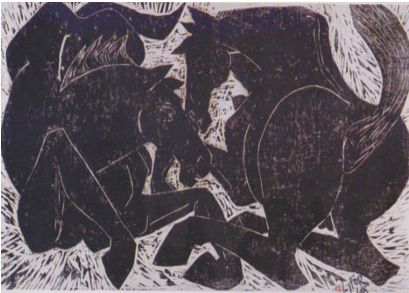
Photo 9 Lee Joo For, Cavorting Horses (1968). Woodcut AP. 30 × 56 in. Source: Tan (1995: 44).