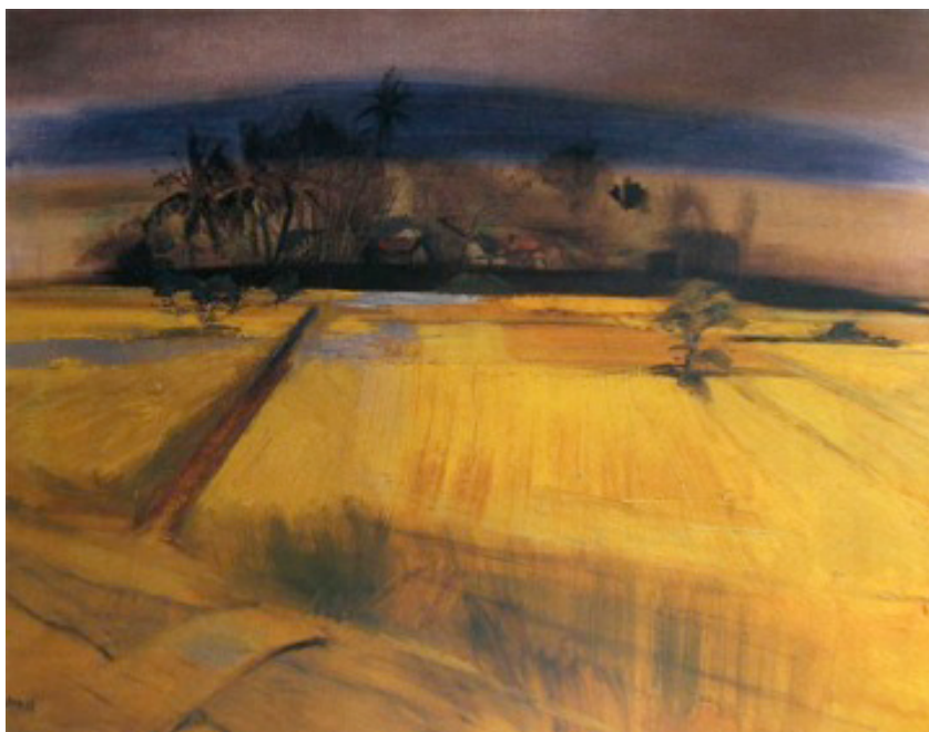
Photo 10 Yeoh, Jinleng, Ricefields (1963). Oil. 84.5 × 104.5 cm. National Visual Art Gallery, Kuala Lumpur.