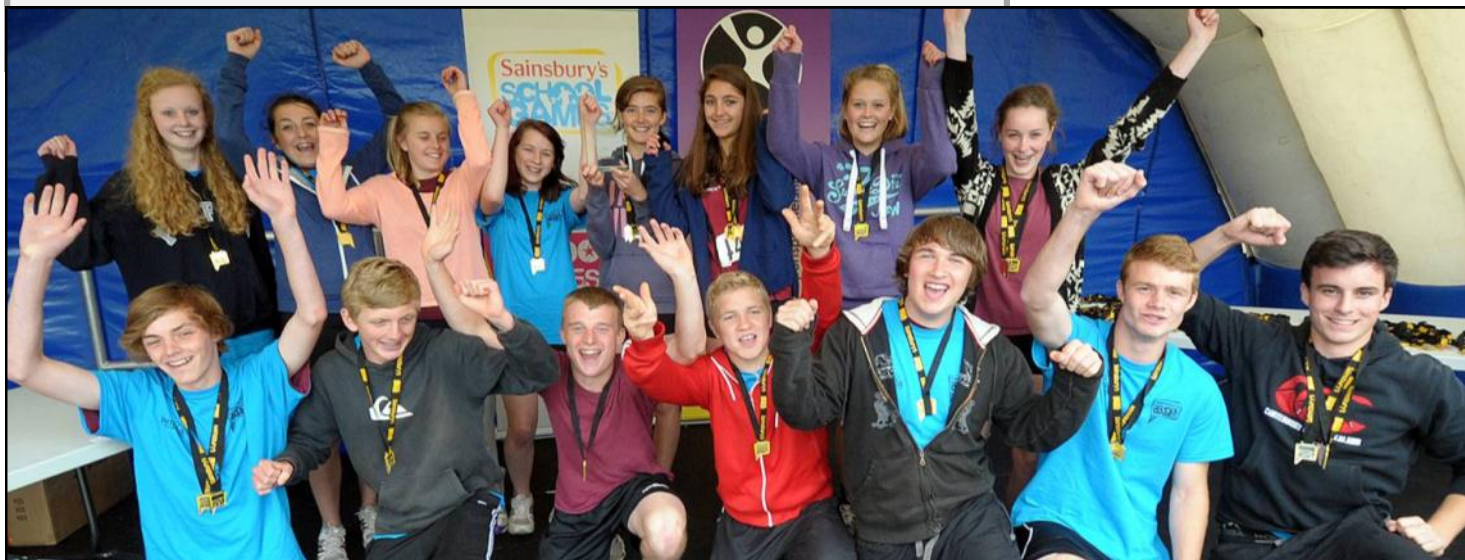
Richard Lander won the Cornwall School Games earlier this week. Well Done Everyone!