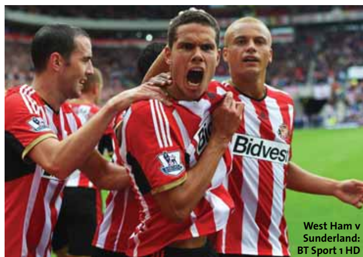
West Ham v Sunderland: BT Sport 1 HD

Sunday February 28 4.30pm Sky Sports Capital One Cup: The Final