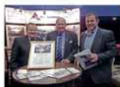
ACE pleased to support the CIU Clubs at the 2014 Conference and Exhibition

Re-upholstery and refurbishment work also carried out