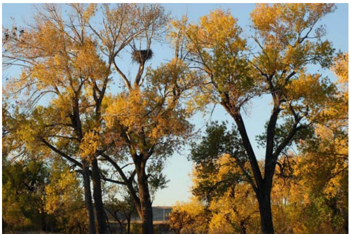
Bald Eagle Nest at Coal Creek in October.