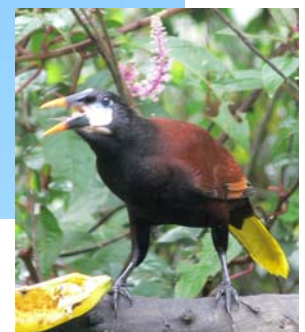
Oropendola and nests Costa Rica & Belize