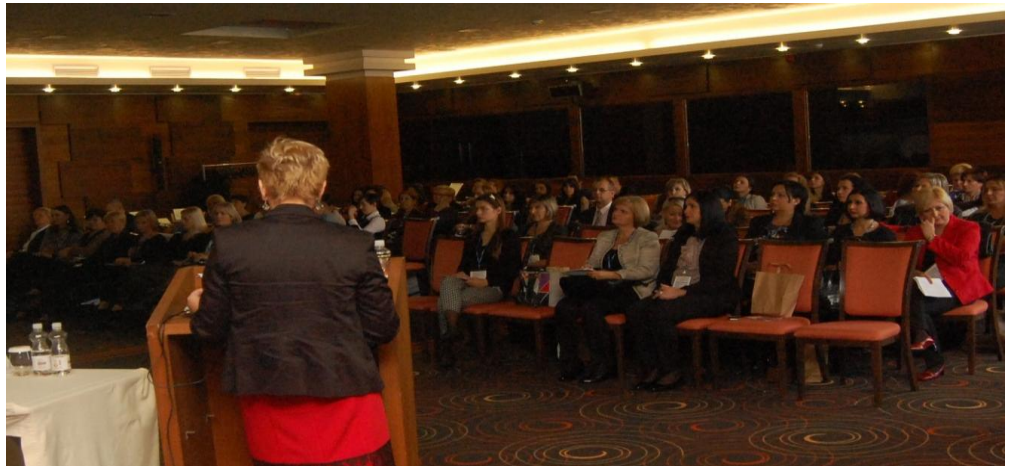
Picture 12. First Neurosurgery Nursing Symposium of the Southeast Europe Region aroused considerable interest and participated by over 100 participants from across the region.