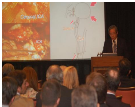
Picture 7. Prof. Yong-Kwang Tu, President of the World Federation of Neurosurgical Societies (WFNS) after opening the Congress gives a plenary lecture in the Central Congress Hall.