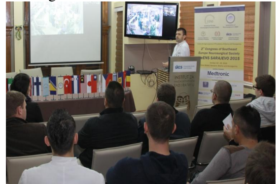
Picture 3. The course has aroused great interest of young neurosurgeons and the participants in the course who spent the whole day from 8 in the morning until 9 o'clock at night. Between every particular surgeries, lectures was given and discussions during the breaks were very active.

The next day, October 22 nd , 2015 was followed by the Pediatric Neurosurgical Endoscopy Course with leading teacher Prof. Memet Özek from Istanbul, Turkey. This course was also followed with lot of interest by fellow colleagues. The Course participants, 70 of them, had the opportunity to watch to the late afternoon many excellent presentation and discussions.