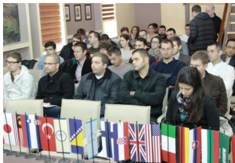
Picture 1. Participants of the Cerebrovascular course relentlessly followed the operation (October 21 st , 2015).