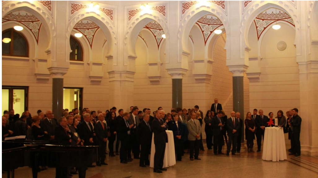
Picture 6. Welcome Cocktail with Mayor of Sarajevo (City Hall, October 22, 2015).

the opportunity to visit the Down Town (Bascarsija) or enjoy in the dinners in some extraordinary restaurants with national and international kitchen.