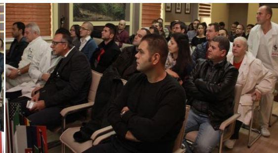
Picture 2. Participants of the Pediatric course in a crowded hall of the Institute (October 22 nd , 2015).

The Course participants had the opportunity to watching live surgery in the operating room but also in a multimedia hall close to the operating theater. They observed 3 operations (2 aneurisms and one AVM), and between the operations discussed with the operator about the cases, surgical technique, indications etc. The organizer is granted with free of charge for all