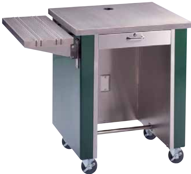
R1-CS shown with optional solid ribbed tray slide

The Reflections Cashier Stand is a comfortable workstation. Ideal for use in cafeteria/buffet lines, school line ups and hospital cafeterias. This Reflections unit is compatible and will interlock with other Reflection units or the Cashier Stand can be operated as a freestanding separate unit.