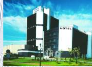
Venue of the Conference