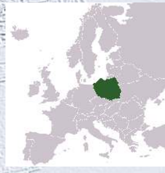
Poland in Europe