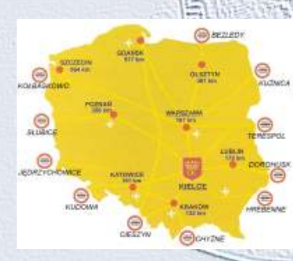
Location of Kielce