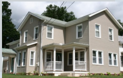
The Beacon House, the residential home for women in treatment