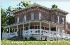
The Noble House, the home of the Pathway House program for men in treatment