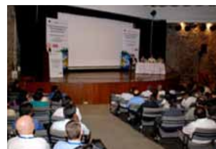
Closing Plenary at the India International Centre in Delhi

The conference also highlighted the need for developing and applying city-wide carbon counting and urban sustainability tools, and aligning Indian environment rating systems such as GRIHA and LEED-India in line with international rating systems. It also called on the building community to avoid 'green washing' by focusing on measuring the 'actual' energy performance of building through post-occupancy evaluation, so that we can move towards evidence-based green building design and performance.