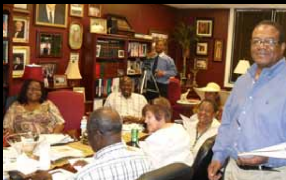
A festive moment at The Teacher's Rights Seminar in MACE's D. D. T. Conference Room.