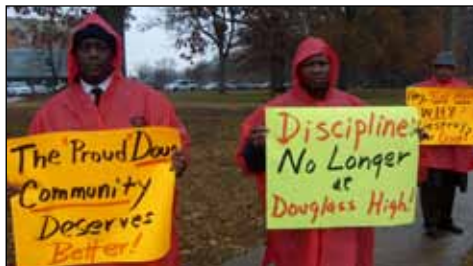
MACE regularly pickets in the pouring rain. When a picket needs to take place, it takes place! This particular principal at Atlanta's Douglass High School abruptly resigned during the middle of the school year after this picket and after MACE assisted a teacher in filing an Official Complaint against the principal with the Professional Standards Commission (PSC).