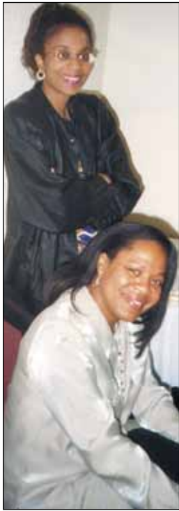
Chillin' at a MACE Holiday BASH.