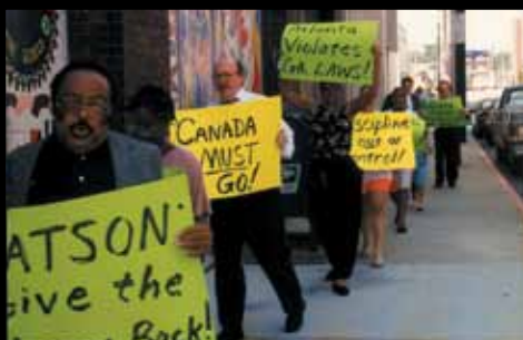
The late and legendary Hosea Williams leads this MACE picket at Atlanta's 210 Pryor Street in 1996.