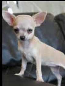
This dog makes a lot of noise, barking most ferociously. She sounds very frightening. But, when you examine her up close, you realize that she's just a high-strung, nervous, and tiny dog. She's really incapable of hurting anyone. Her name is AFT.