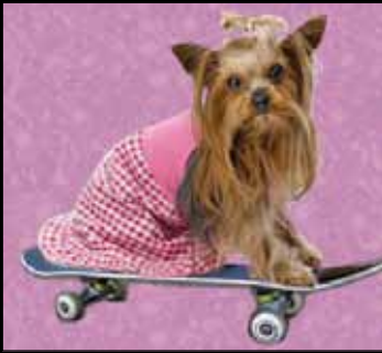
This dog is very cute and can be trained to do certain acts. She is a harmless lap dog and her name is PAGE.