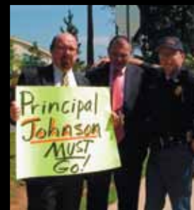
The Kell High School (Cobb) principal and the Cobb County police officer can't get the MACE Team to leave the sidewalk (2004).