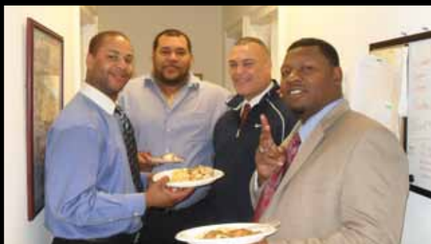
The Men of MACE enjoying a lighter moment at the MACE Office

Grievances, Tribunals, Letters, Rebuttals, Hearings, Articles, Evaluation of Administrators, Editorials, Pickets, and More! Don't miss a thing! Go to MACE's informative, colorful, and entertaining on-line magazine, TheTeachersAdvocate.Com !