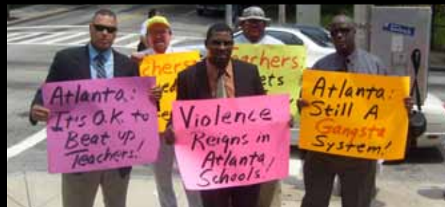
MACE also rallied against the Atlanta and DeKalb systems being "gangsta systems" way before the media picked up on the corruption.