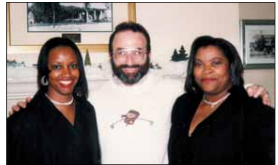
MACE is known for its effective grievance representation, its quick responses on the phone and in person, its publications, its rebuttals, its letters, its pickets, and, last but not least, its fun parties! But, MACE is not known for SPELLING BEES!