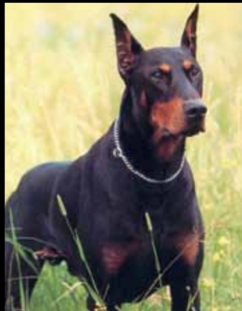
This dog is strong, smart, and savvy. He is "preferred by the armed forces for guard and patrol work." He is a no-nonsense type of dog. He is fiercely loyal to his master and he will hurt anyone who attacks his master. He answers to the name MACE.