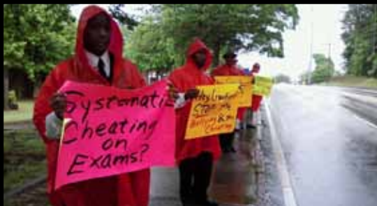
MACE rallied against systematic cheating in the DeKalb and Atlanta systems before the media jumped on the issue.