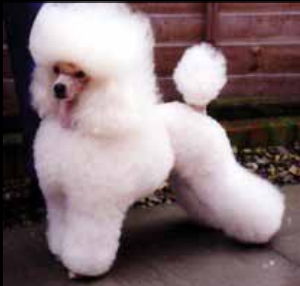
This dog is pretty and has fluffy hair. She is considered a "toy." She yelps from time to time but cannot be depended on for defense. It's just not her nature to defend. She is called GAE.