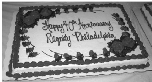
Dessert at the Dinner Dance