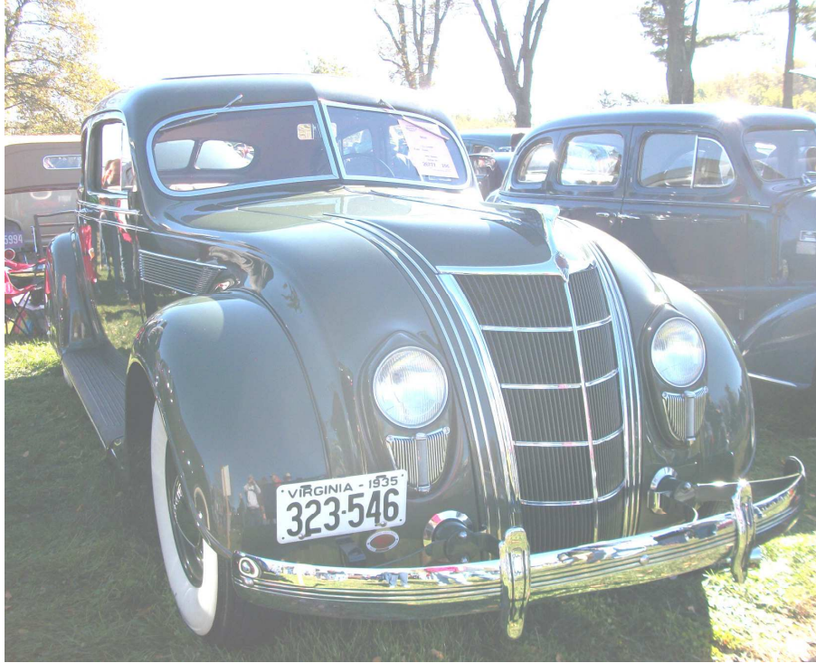
1935 Chrysler Airflow