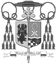
Office of the Archbishop