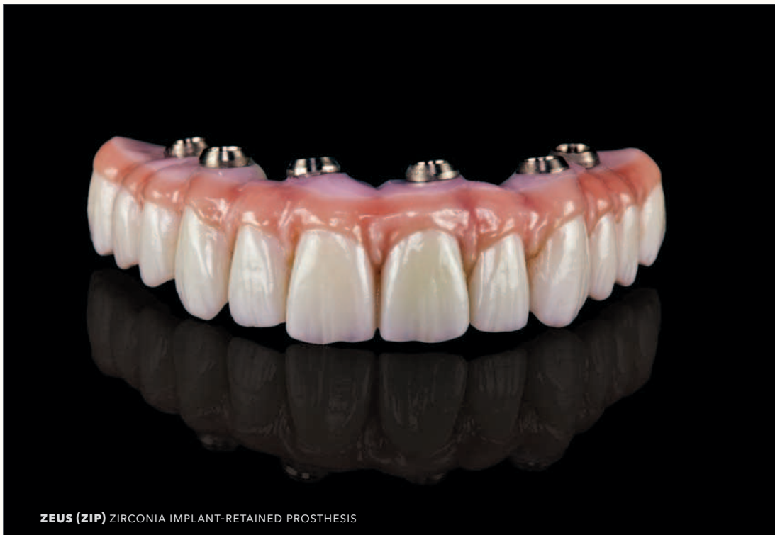
ZEUS (ZIP) ZIRCONIA IMPLANT-RETAINED PROSTHESIS