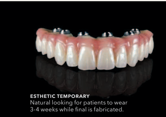
ESTHETIC TEMPORARY Natural looking for patients to wear 3-4 weeks while final is fabricated.