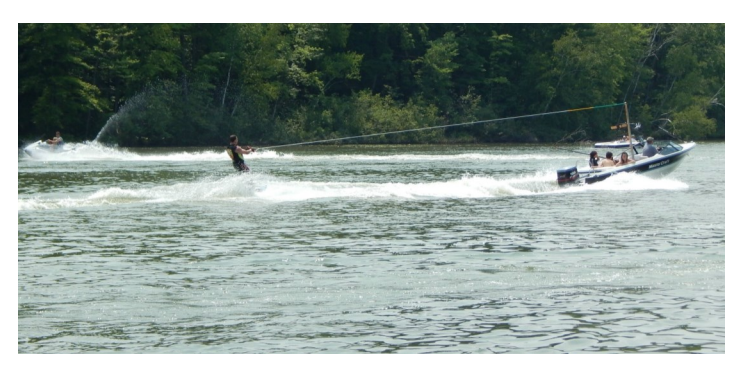
A water skier and a personal watercraft operator pass on Grass Lake, just two of the many uses of Cloverleaf Lakes.

Peace, quiet and nature lovers. We want to hear and see