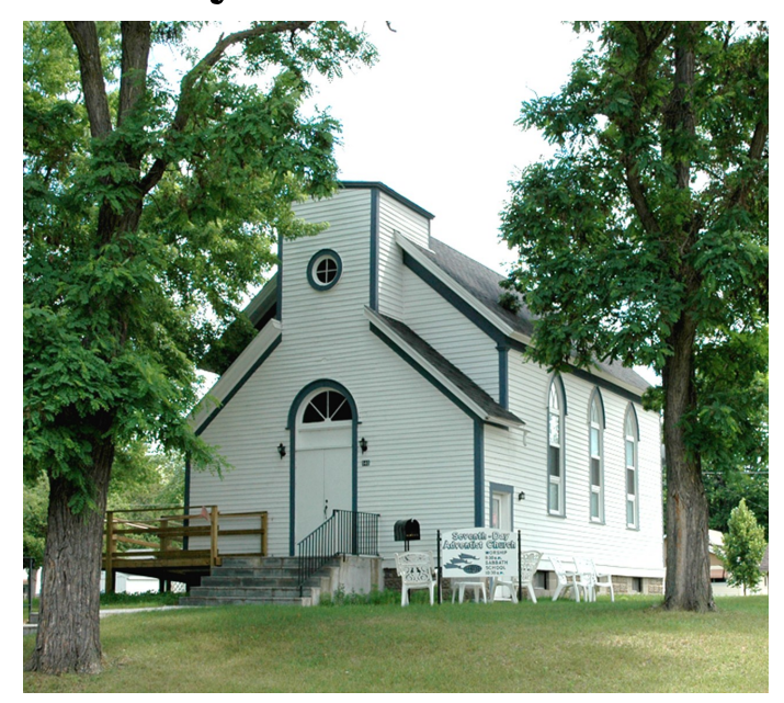
The Seventh-day Adventist Church, which originally stood in Belle Plaine, would be moved to Shawano's Heritage Park if the Historical Society raises enough money.

to the Shawano County Historical Society Church Fund and sent to 524 N. Franklin St., Shawano 54166.