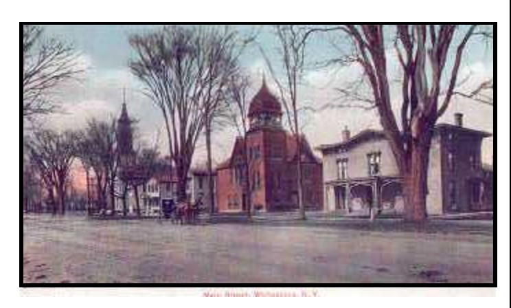
Main Street, Whitesboro, NY in the mid 1800s

With the building season well underway, it's time once again to advise you when planning any improvements a building permit may be required. When planning or ordering your pool or shed or other improvement, this is the time to start the permit process. Again, this year the village experienced numerous additions, sheds and pools, all of which help to reinforce the way this community is looked at: a Good Place to live.