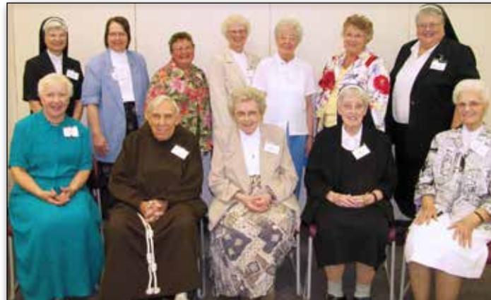
St. Thomas More Parish in Appleton recently honored men and women religious who have served in the parish over the years. The celebration was part of the parish's observation of the Year of Consecrated Life.