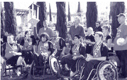
San Diego Hammer - Varsity National Champs