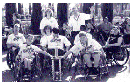
W. GA Wolverines - JV National Champs