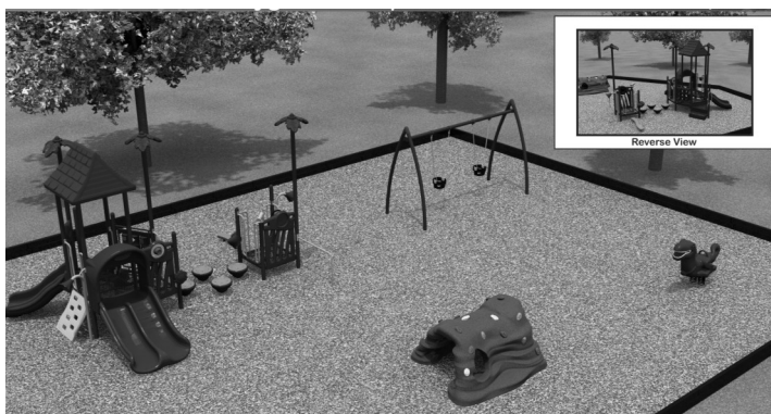
Drawing of the new toddler play equipment at Roscoe Roof Park.

The area will include a climbing tunnel, swings, slide, and balance equipment and is designed to compliment the design of older children play equipment. The new toddler park will be installed mid to late summer – weather permitting. The Village was able to acquire the equipment with grant monies from CDBG and matching funds from the Carlisle Park Fund – which includes proceeds from prior year golf scrambles.