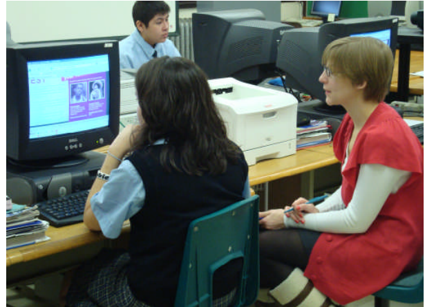
St. Barbara eighth grade student working with one of the coordinators of the Chicago History Museum