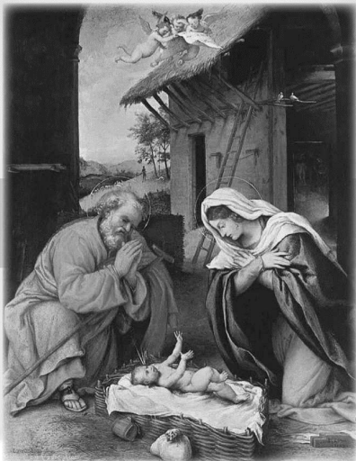
The Holy Family of Jesus, Mary, and Joseph

"...this is Christ the King, whom shepherds guard and angels sing; ...the babe, the son of Mary."